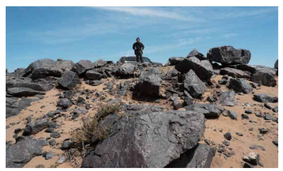
Iron ore outcropping at the Oyut Ovoo mine site 於遨遊敖包礦區露出之鐵礦

冠亞集團受全球金融海嘯的餘波影響,業 務於二零零九年在艱困的環境下經營。上 半年訂單減少,下半年在經濟復甦的支持 下,情況有所改善。冠亞集團憑藉完善的 服務網路和鞏固的客戶基礎,在銀行自助 設備的銷售和服務方面保持穩定收入。來 年內地預期將繼續貨幣寬鬆政策,銀行處 理現鈔的數量將繼續上升,令銀行有需要 增添自助服務設備。冠亞集團將繼續專注 自動服務設備的維修及保養業務,利用其 銷售網絡和已有的客戶基礎,冀能提高客 戶在合約期滿後繼簽新合約的比率。在服 務現有客戶的前提下,擴大對目前採用其 他品牌客戶的服務。然而市場在二零一零 年並未全面復甦。同時由於各項社會保障 政策的調整和勞動法的實施,企業成本快 速上升,抑制了盈利空間,無論設備銷售 或維修價格都面臨進一步下調的壓力,冠 亞集團預期經營將面對更多困難,但對新 一年業務前景保持審慎樂觀。