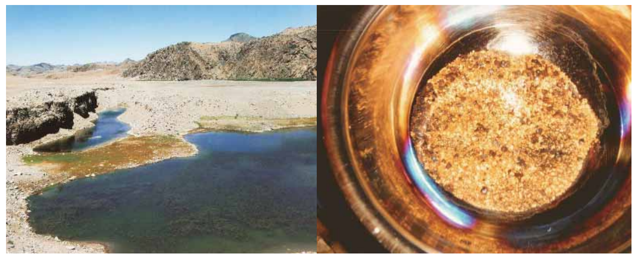
The site of the alluvial gold mine located in Khar Yamaat, Sheriin Gol and Khongor Soum of Darkham province, North Mongolia

鑑於全球對黃金之需求持續上升,加上金價攀升及世界各地之金儲藏量供應有限, 收購蒙古大地為本集團提供甚為可觀的投 資機會,其作價合理之餘,亦無須投入龐 大的資金。此外,砂金礦開採本身並非資 本密集業務,要求之生產程序亦較傳統岩 金礦開採簡單,因此可為本集團帶來更快 的現金流。